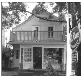
Apartment above retail store.

If you have any questions about these zoning regulations or others that affect your ability to create affordable housing, please contact us.