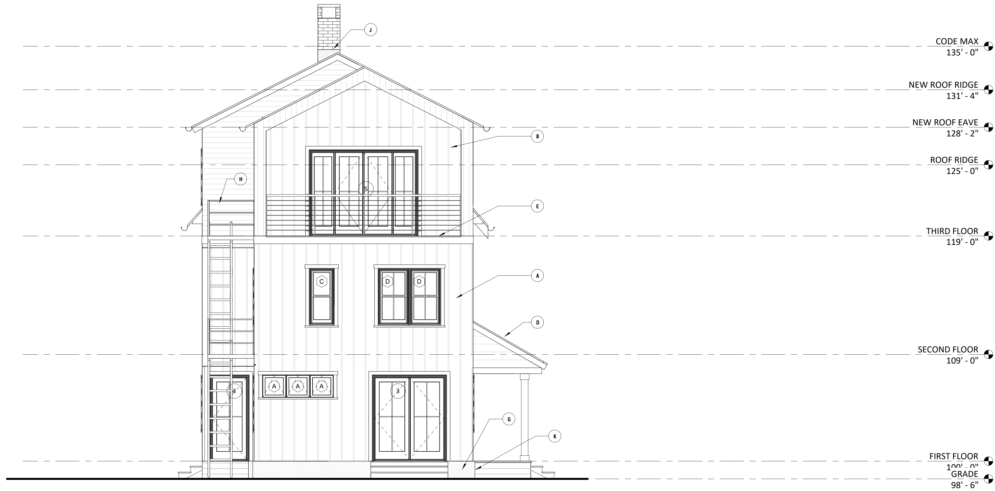
1 SOUTH ELEVATION A1.0 | A3.2 1/4" = 1'-0"

I:\MacHome\Dropbox (LyonsPlain)\01_LPA_PROJECTS_Folder1_3_PROJECTS_2021\2118_ACADEMY ROAD_MAIN MODEL-ROOF EDIT.rvt