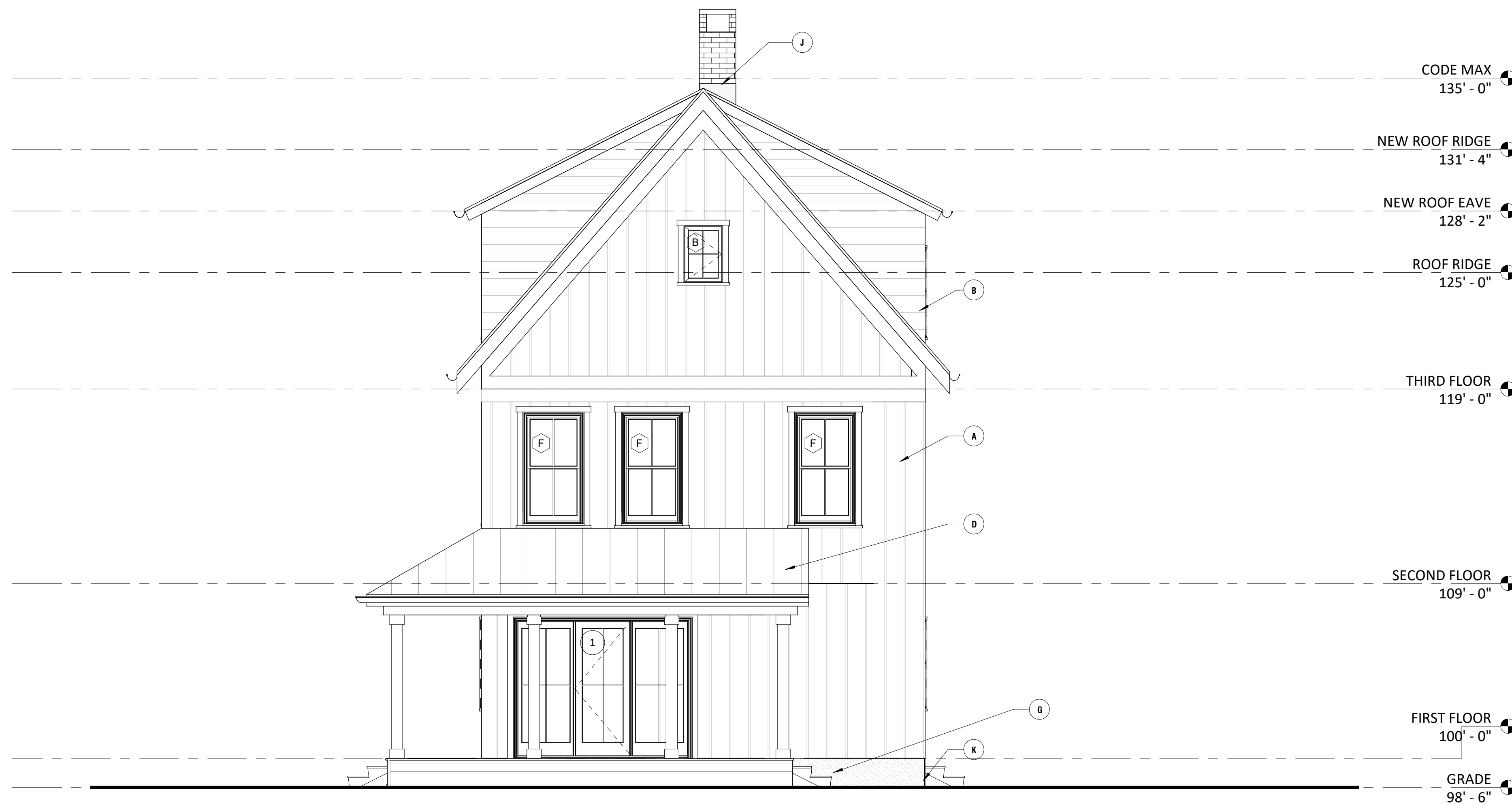
1 NORTH ELEVATION A1.0 | A3.1 1/4" = 1'-0"

I:\ArchHome\Dropbox (LyonsPlain)\01_LPA_PROJECTS_Folder13_PROJECTS\2021\2118_ACADEMY ROAD_MAIN MODEL-ROOF EDIT.rvt