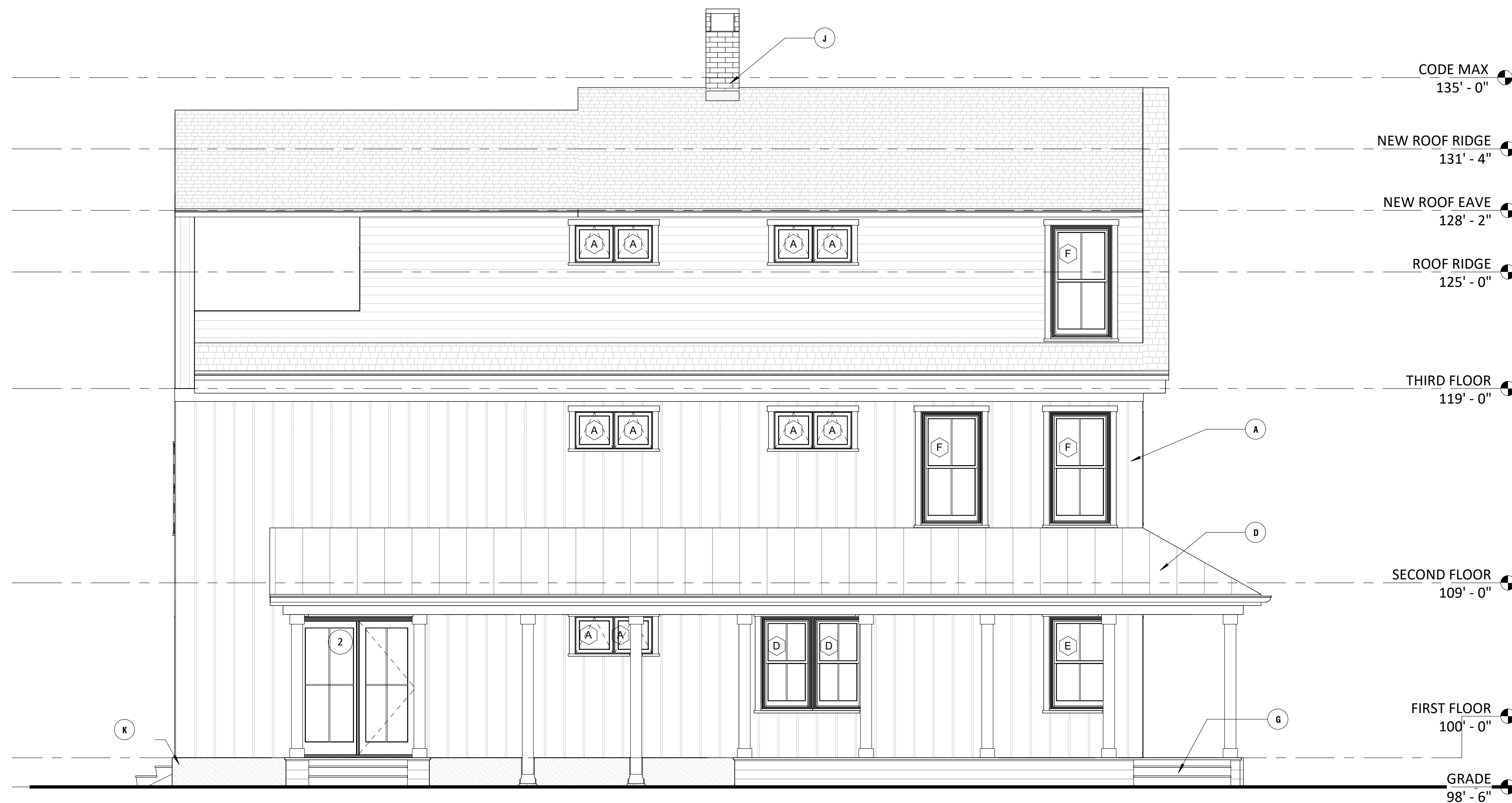
2 EAST ELEVATION A1.0 | A3.1 1/4" = 1'-0"