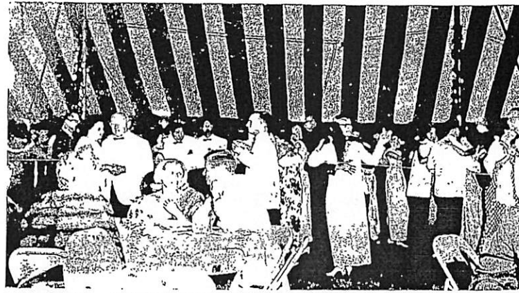
A DANCE EVENING... and a smashing success. Guests who filled the Gaslight Ball to capacity thoroughly enjoyed every minute of the gala evening while adding substance to the Sharon Hospital benefit fund.