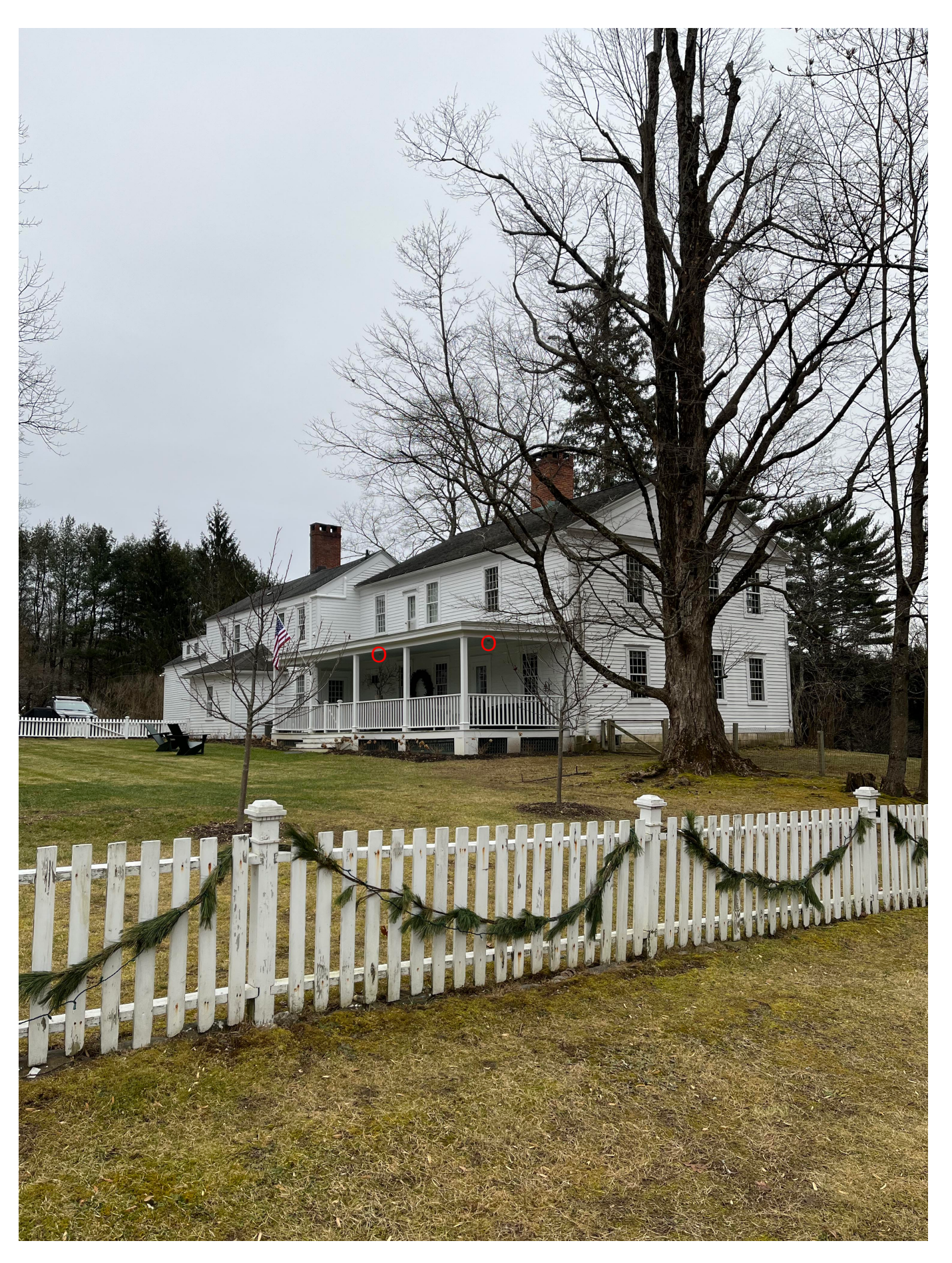
Buckley House from Main St, Showing North-Facing Porch (Added in the 20th Century)