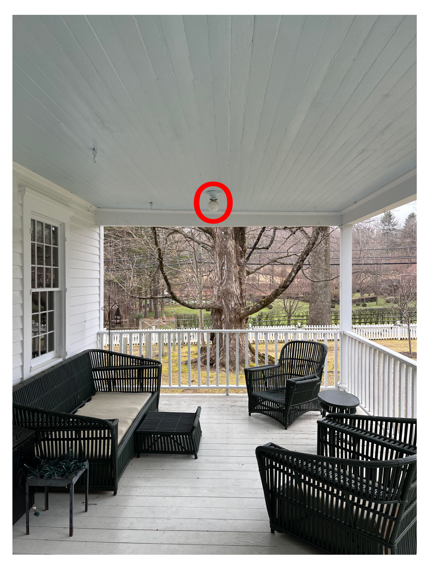
Fixture Location 1