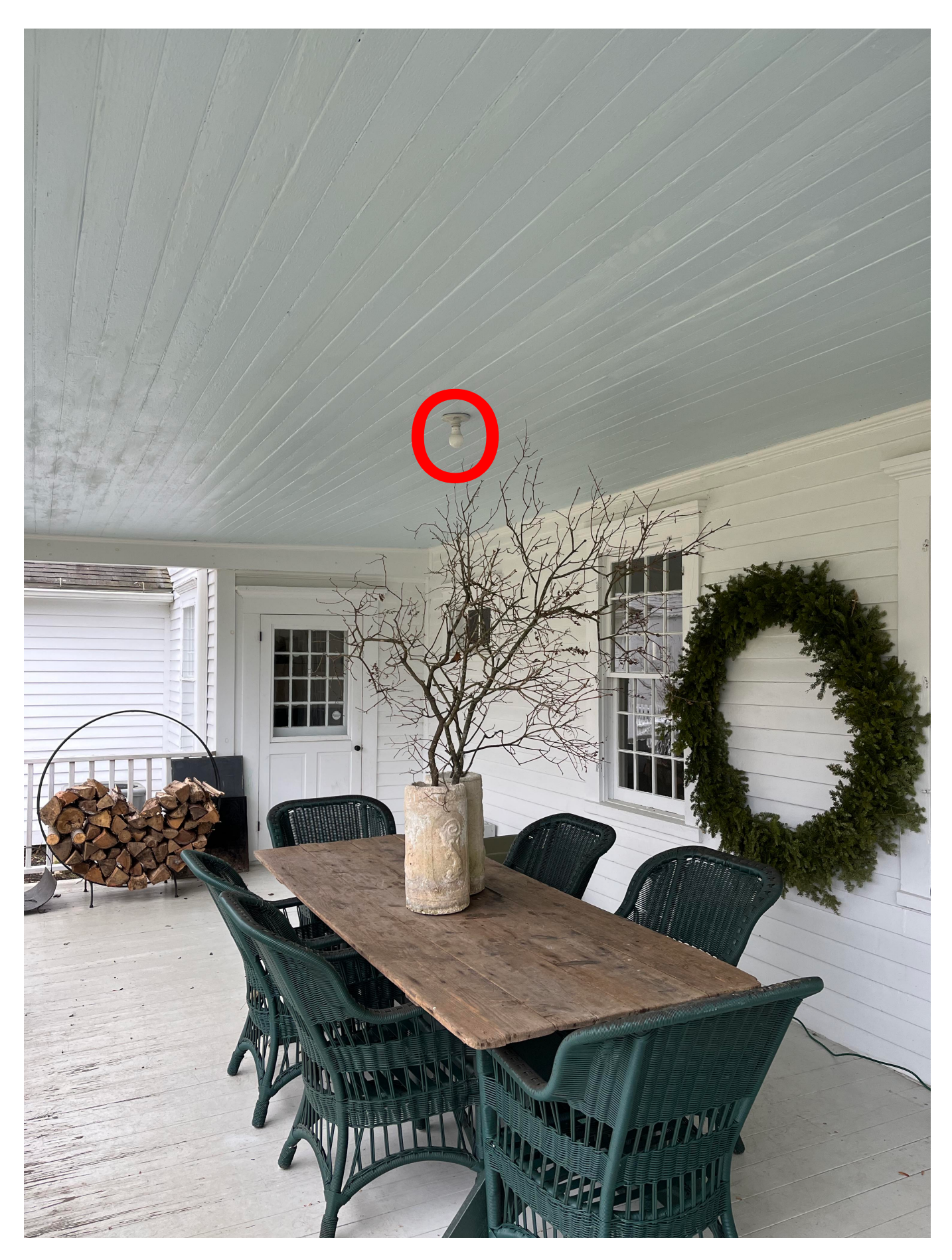
Fixture Location 2