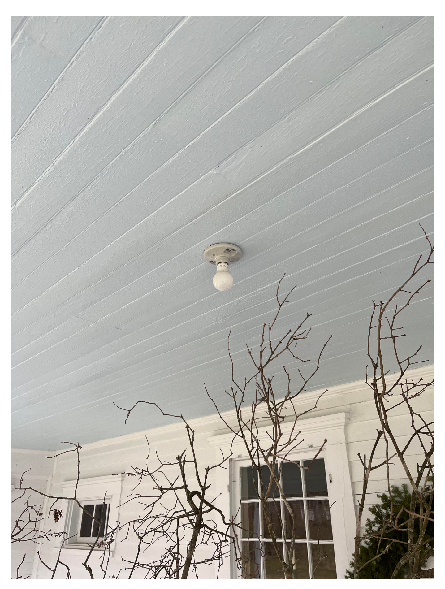
Existing Exposed Bulb Socket