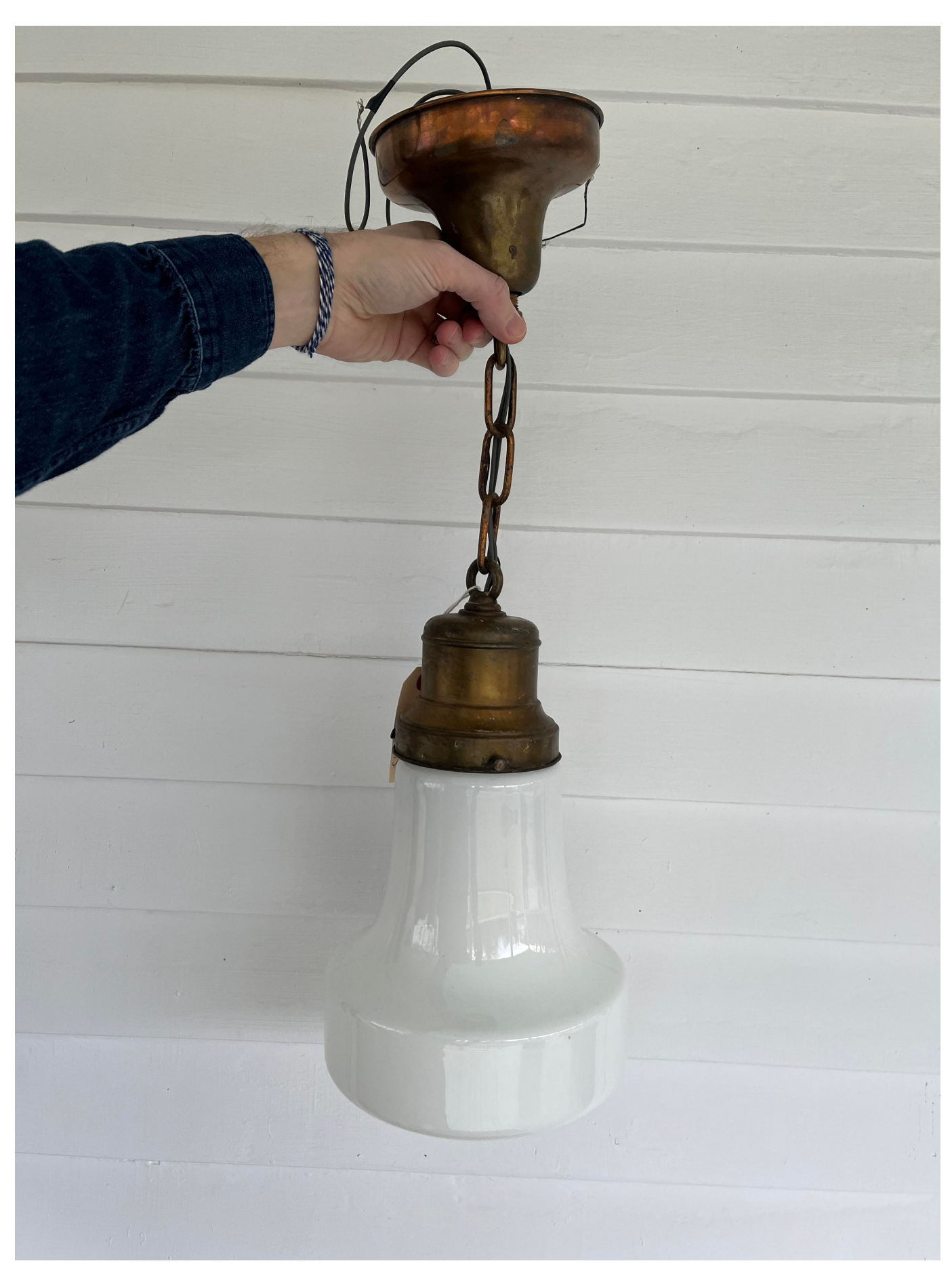
Proposed early-20th Century Pendant (x2) to Replace Existing Socket Locations